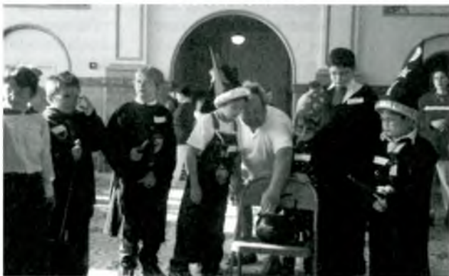
The Harry Potter Premiere Party was held at the Depot Branch of Bowling Green Public Library. The party was sponsored by Western Kentucky University Libraries to promote its Southern Kentucky Festival of Books.

The Association of Academic Health Sciences Libraries (AAHSL) and OhioLINK, a consor-