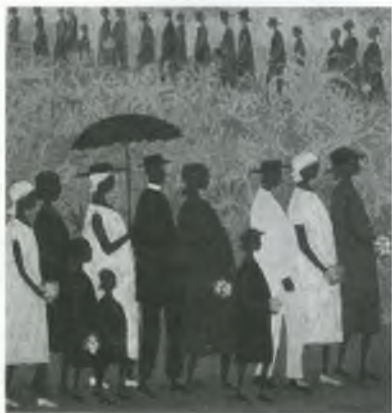
This image from the homepage of the Amistad Research Center at Tulane University was created by Ellis Wilson and is called "The Funeral Procession."

... programs and services were developed to reach the nontraditional library users, resulting in greater access to information for Blacks and other minorities. . . . Remember, libraries did not always serve all people. Before the mid-1800's, libraries were mostly for scholars, university students, and the rich. Years of struggle by progressive librarians eventually changed this narrow role of libraries, and made them the open, vital information centers they are today. 5