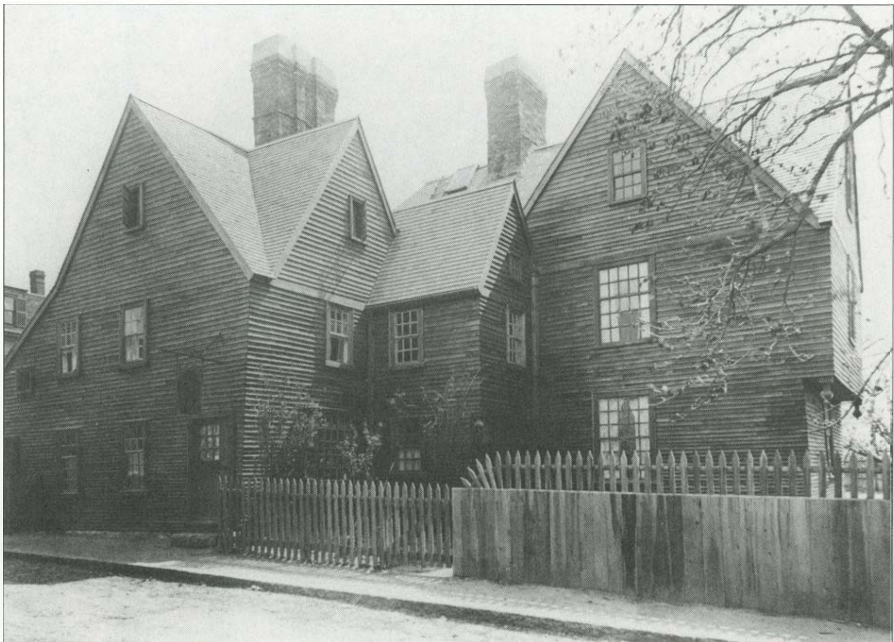
The House of Seven Gables.

technology excludes a concern for paper and print.