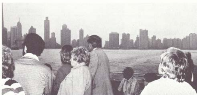
ACRL Boat Trip—members get a good view of the Chicago skyline.