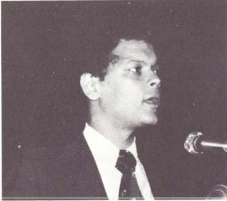
Julian Bond addresses ACRL . . .