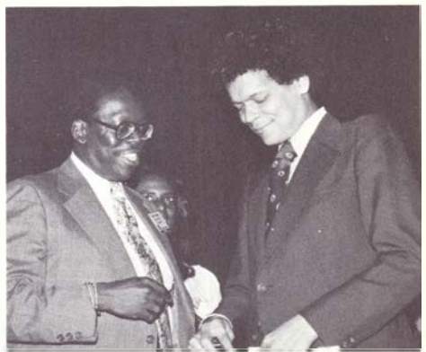
Julian Bond meets and talks with ACRL members.