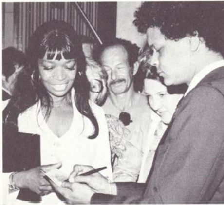
. . . and signs autographs.

ACRL and its various sections sponsored over twenty programs on all aspects of academic librarianship during the 1976 centennial conference. Ethnicity, ACRL's main theme, was the topic of Julian Bond's address. Bond, state senator from Georgia, spoke to over 1,500 librarians at the ACRL program meeting. The questions addressed to him following his speech ranged from why he didn't support Jimmy Carter to his future plans as a movie actor.