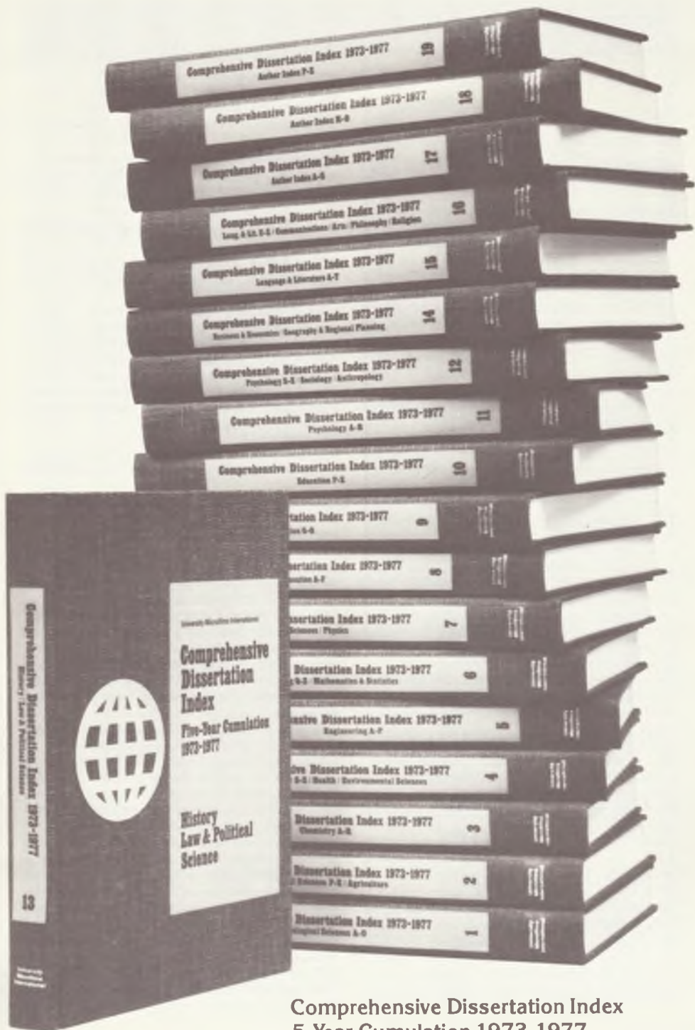
Comprehensive Dissertation Index 5-Year Cumulation 1973-1977