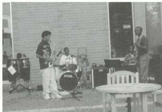
The Eau Claire High School Band at Columbia College in South Carolina.

There are two ways academic libraries can host an ALA traveling exhibition.