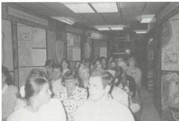
Visitors enjoy "The Many Realms of King Arthur" traveling exhibit at York College.