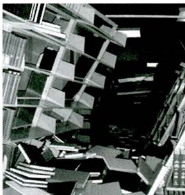
A view of the earthquake's damages to the University of Washington's Engineering Library.

The library uses the 3M Digital Identification System, based on radio frequency identification technology, to manage its collection. This system integrates automated systems with 3M Tattle-Tape security.