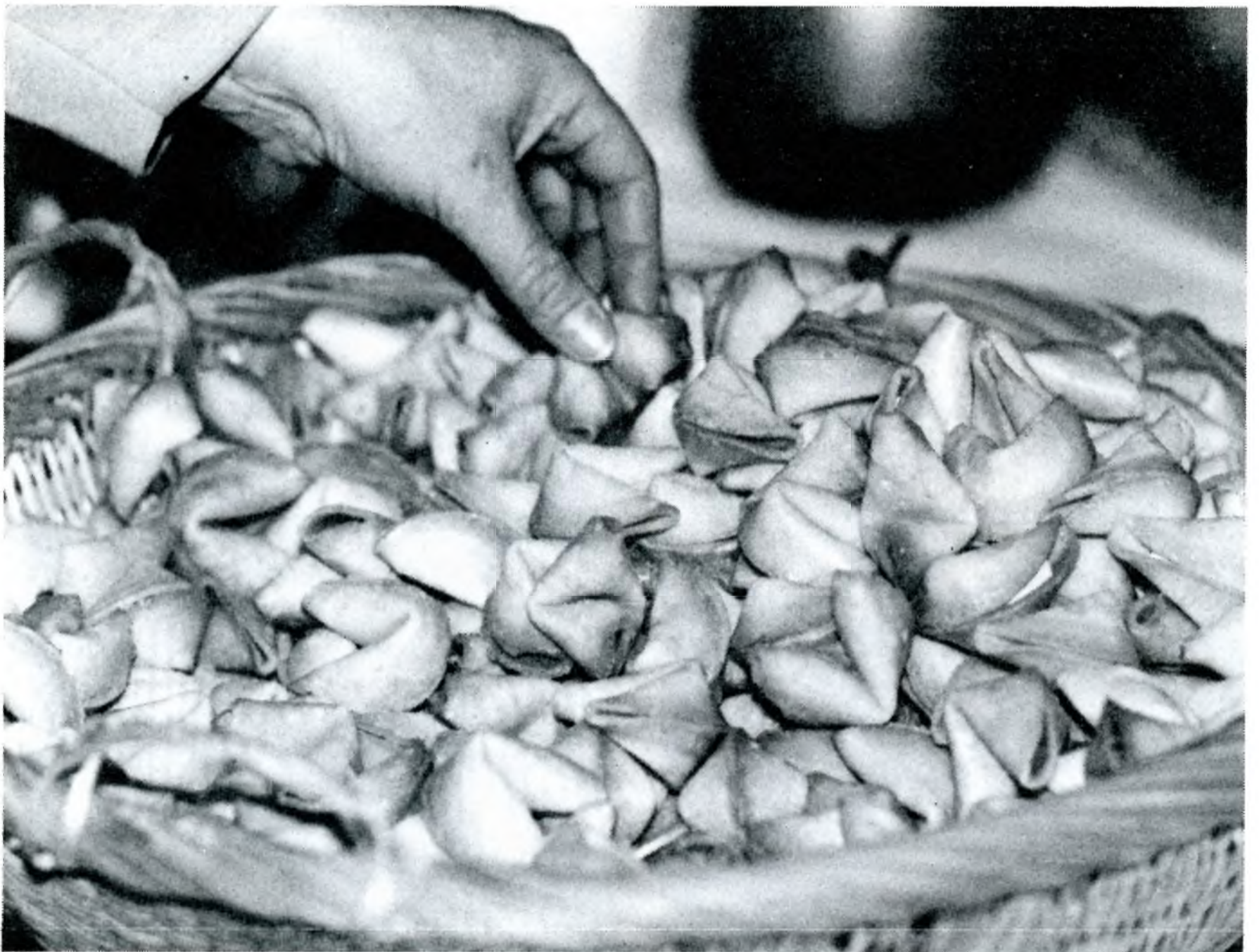
Will there be a tall, handsome online database salesperson in your life? Library-related fortune cookies hold the answer.