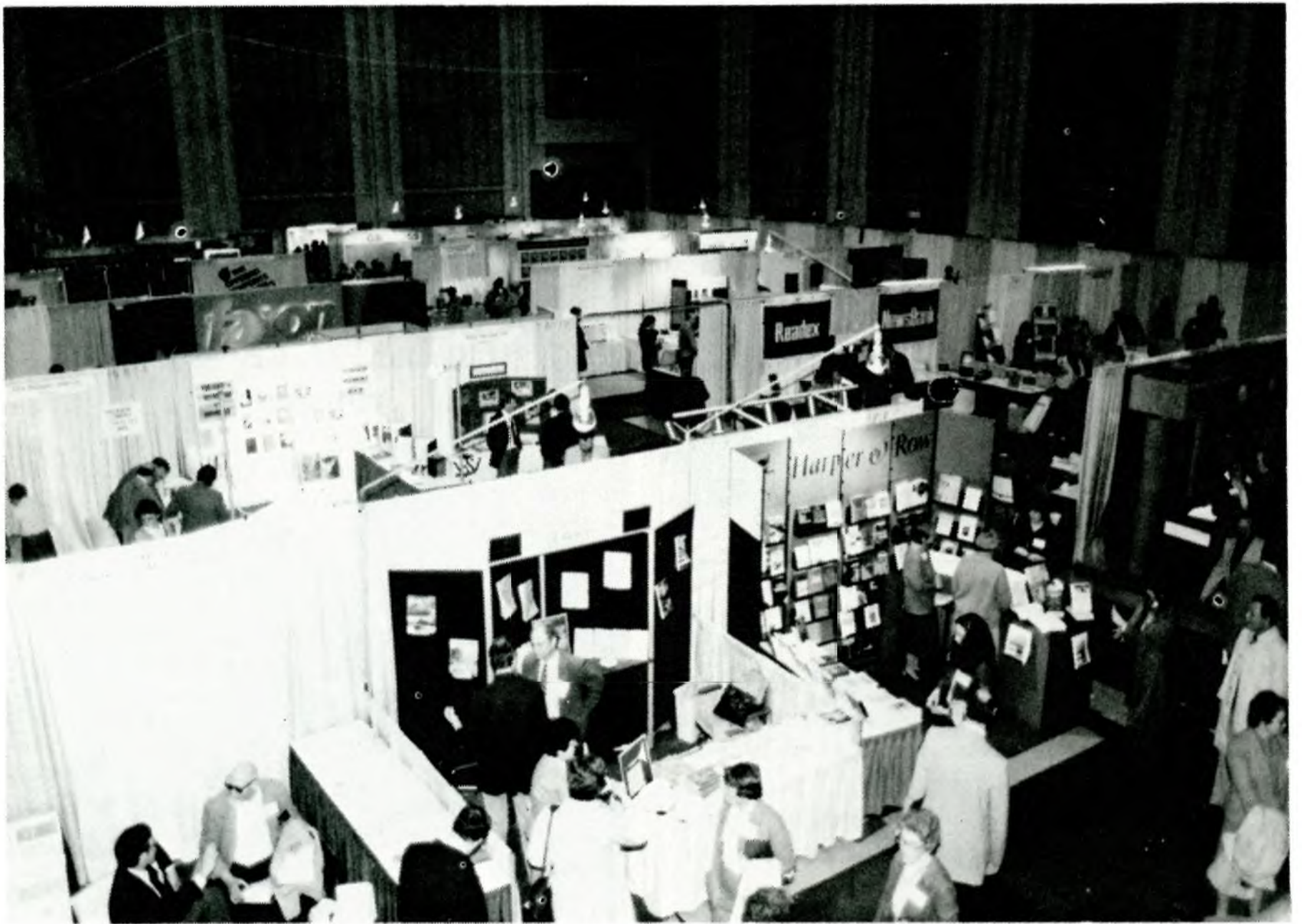
A bird's-eye view of the booths of some of the 125 companies that had exhibits at the Seattle Center.