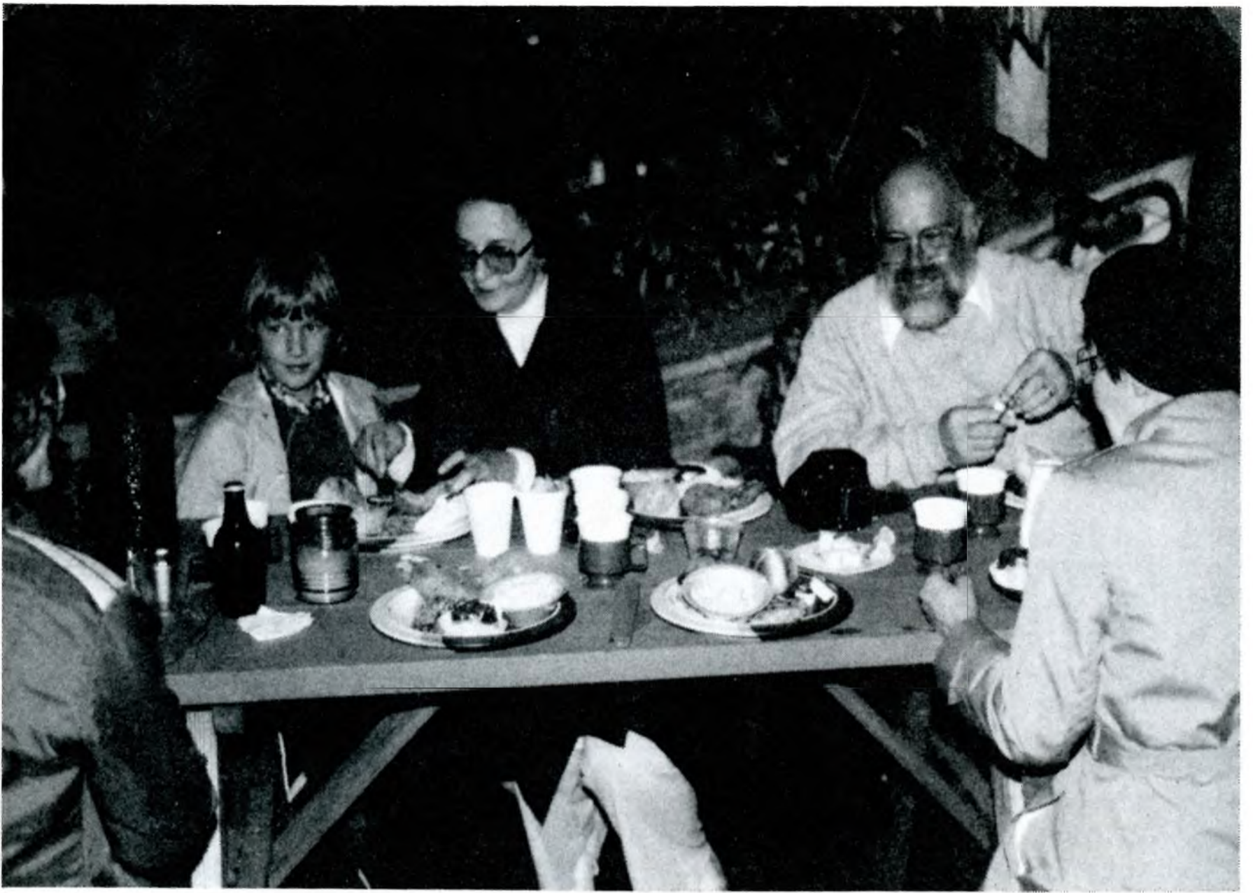
Conference-goers enjoying fresh salmon at the Kiana Lodge Salmon Bake.