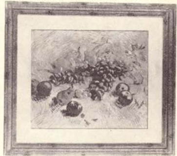
C-101 VINCENT VAN GOGH: "Still Life with Fruit". 1887