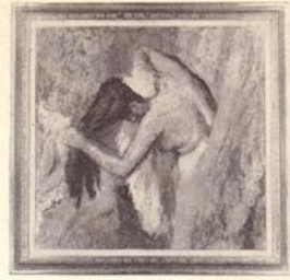
C-103 EDGAR DEGAS: "Woman at her Toilette". 1903