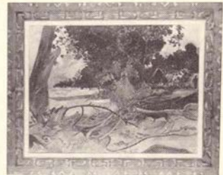
C-105 PAUL GAUGUIN: "The Burao Tree". 1892