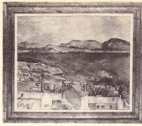
C-107 PAUL CEZANNE: "The Gulf of Marseilles, Seen from L'Estaque". 1886-1890