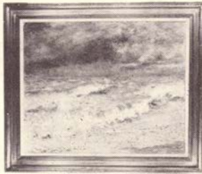
C-108 AUGUSTE RENOIR: "The Wave". 1897