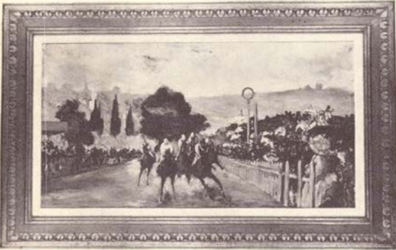
C-104 EDOUARD MANET: "The Races at Longchamp". 1864