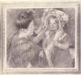
C-102 MARY CASSATT: "Mother and Child". 1888