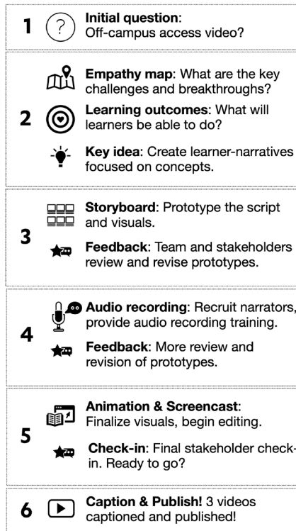
The six-day grassroots media production timeline.

It was a busy week, full of extensive collaboration. For some, it was the first time they had been directly involved in a media production project. And for everyone involved, coming together to prioritize the