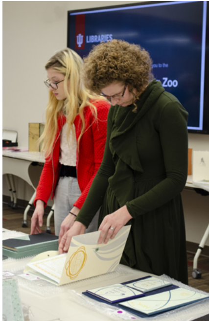
Handmade books.

As a part of our WBCD programming, we gave future school professionals an opportunity to handle these unique pieces of art. Our team set up a viewing table in a common area to give users access to special collections. Attendees reacted with astonishment, wonder, and admiration when they encountered these works. This interaction allowed us to share with each visitor the history and techniques used by book artists, and provide a handout that explains how to locate other artists' books collections in the Midwest. We encourage you to think about unexpected resources your library may have that invoke a sense of wonder or surprise in your audience.