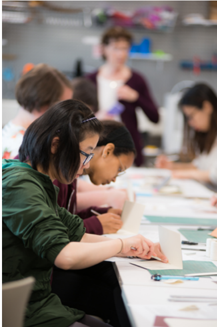
A participant uses technique to bind her writing journal

We learned that while WBCD may present opportunities to educate faculty about OA principles and Big Deal agreements, those were not topics that drew an engaged crowd. Rather, it was having an expert available for contract consultation