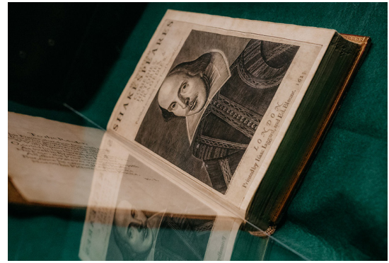
William Shakespeare's Comedies, Histories, & Tragedies being digitized.