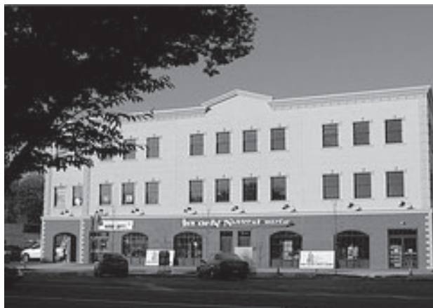
CHOICE's new Liberty Square office condominium in Middletown, Connecticut.

In September 2010, CHOICE received notification of the approval of its Commercial Interior LEED application for its new Liberty Square office condominium in Middletown, Connecticut. LEED (Leadership in Energy and Environmental Design) certification is granted to projects that meet national standards for sustainability and green practices in building design. Congratulations to Irv