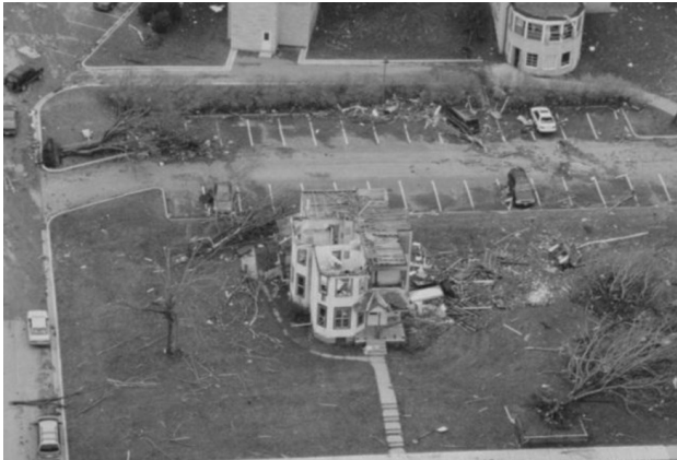
Destroyed Swedish House on the campus of Gustavus Adolphus College.

By the end of the course, however, most students indicated their enjoyment of the