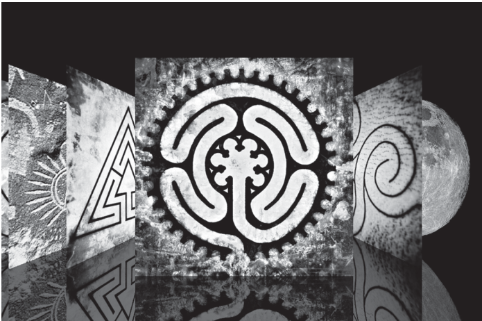
iPad Mini interface.

It became clear to us that a whole new method of labyrinth installation was needed. Coincidentally, we