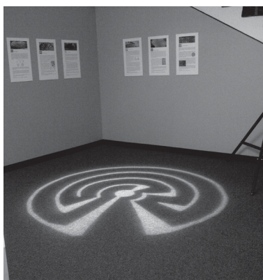
Pima Indian labyrinth design.

computer-centric environment, particularly kinetic styles. Further, computer users are subject to a great deal of stress, tension, isolation, and fatigue, even if they do not realize it.