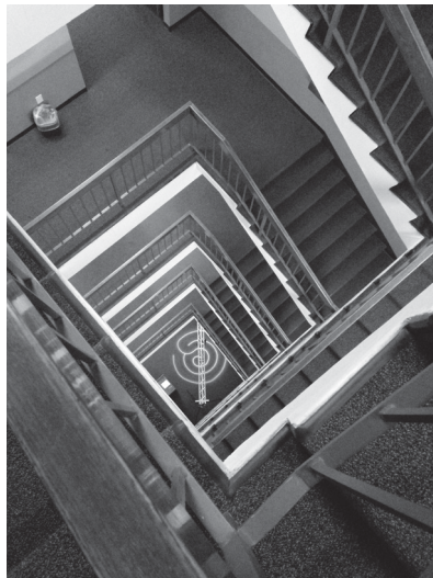
Vedic labyrinth design.