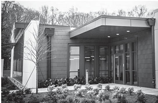
The Emory and Georgia Tech Library Service Center.

The program's primary goal is to reduce costs for students. One proposal for an introductory Economics course offers potential savings of close to $100,000 per semester. Many proposals touted other advantages of alternative textbooks, such as providing more timely and relevant content, engaging students in active learning, and ensuring that every student has access to course materials on the first day of class. The alternative textbook program is funded by library donors and income from the Fred Timms Langford and Verona Lee Joyner Langford Endowment Fund.