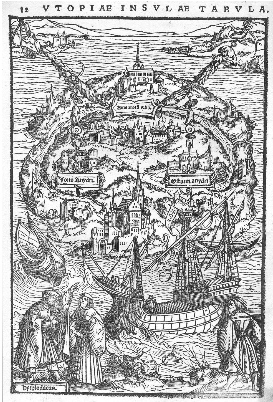
Figure 2. Ambrosius Holbein's map of Utopiae Insulae Tabula with Hythlodæus pointing at the land, for the second edition of Thomas More's Utopia , 1518.