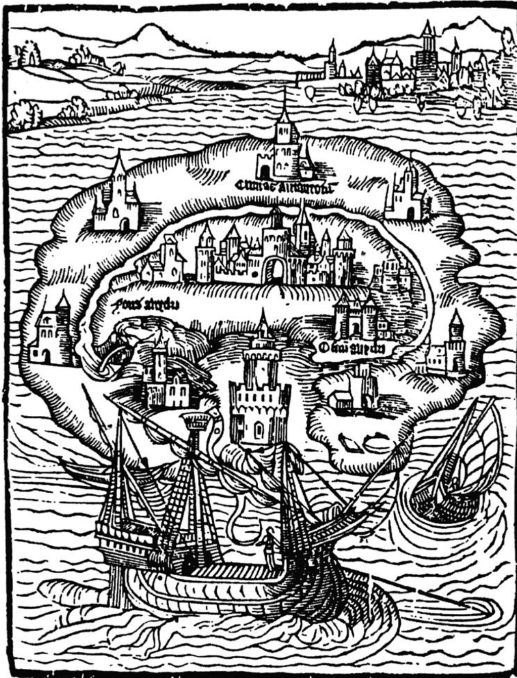
Figure 1. Ambrosius Holbein's map of Insulae Utopiae Figura , for the first edition of Thomas More's Utopia , 1516.

existed and re-creates it according to his will. And yet, in tracing its history back to the original act of rupture and violence, Utopus' nation is condemned to "the temporal paradox of utopia, which is that it both is, and cannot be , isolated from the contamination of the past" (Attewell, 2014, p. 49). This violent transition eventually exposes the dystopian origins of society, demystifying the immutability of the state and offering a glimpse of the potential dissidence among its citizens. Thus, the social and spatial insularity of Utopia, as well as certain misogynistic practices (Sargent, 1973, p. 304), turns this utopia into a dystopia (Serras, 2002).