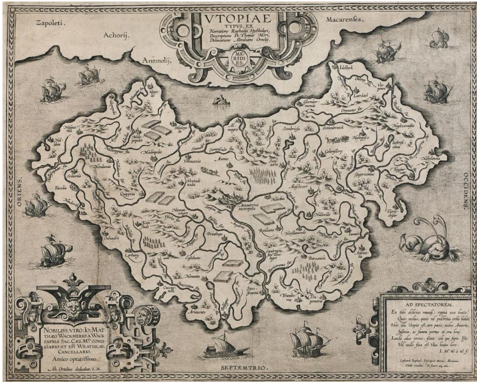
Figure 3. Abraham Ortelius' map of Thomas More's Utopia , ca. 1595.