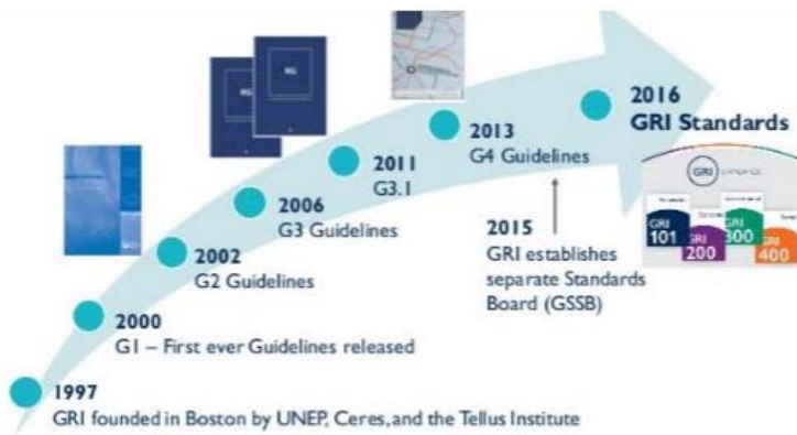
Figure 1. Evolution of GRI and SR Standards Issued

ality and sustainability context. The G4 has two sections - the general standard disclosures (GSD) and specific standard disclosures (SSD) (Owolabi, Taleatu, Adetula & Uwuigbe, 2016; Willis et al., 2015). The GSD has seven subsections that include organizational profile, strategy and analysis, identified material aspects and boundaries, stakeholder engagement, report profile, governance and ethics, and integrity. The SSD has three subsections which include the disclosure on management approach, indicators (economic, environmental and social) and specific disclosure sectors (Willis et al., 2015).