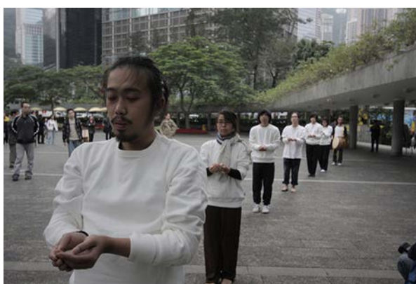
Figure 4. Demonstrators in Single File