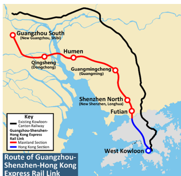
Figure 2. Route Map of Sino-Hong Kong Express Rail Link

The Sino-Hong Kong Express Railway Project related to this study is, to be exact, the construction of the Hong Kong section of the ‘Guangzhou–Shenzhen–Hong Kong Express Rail’. (Figure 2) This involved the selection of the railway terminus which was planned to be on reclaimed land on the western side of the Kowloon peninsula, next to the central business district of Hong Kong. An alternative was suggested for construction in Kam Sheung Road of the New Territories near the border with China as proposed later on, by the non-governmental think tank, Professional Commons.