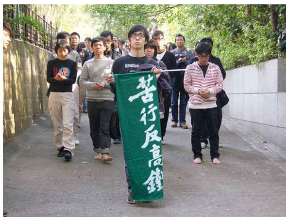
Figure 3. The first person held a small vertical banner