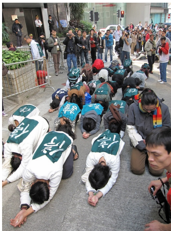
Figure 5. 26-Step Cycle and Kneeling Down