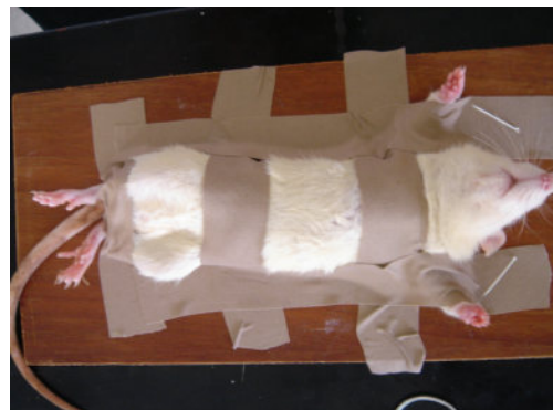
Figure 5. Rat with acupuncture needles inserted.