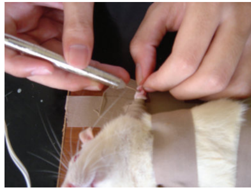
Figure 3. Hegu acupoint located with acupuncture point detector.