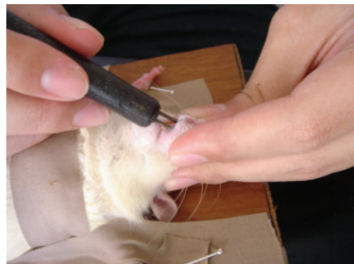
Figure 6. Electro-stimulation on maxillary central incisor gingiva with electro stimulator.