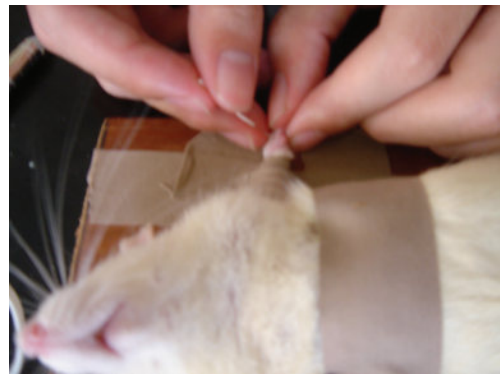
Figure 4. Needle insertion in Hegu acupoint.