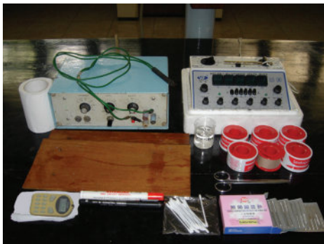
Figure 1. Electro stimulator, acupuncture point detector, wooden fixation board, beaker glass with 75% alcohol, band aid, stopwatch, board marker, cotton bud, scissors, acupuncture needles.

All rats were fixated with band aid on the wooden fixation board at their chest, stomach, upper legs, and lower legs (Figure 2). Hegu acupoint (Figure 3) was located with acupuncture point detector Ying Di KWD-808-I, 6 channel output and 9 Volt DC Voltage (Figure 1), then marked with board marker. The marked points were smeared with cotton bud soaked in 75% alcohol.