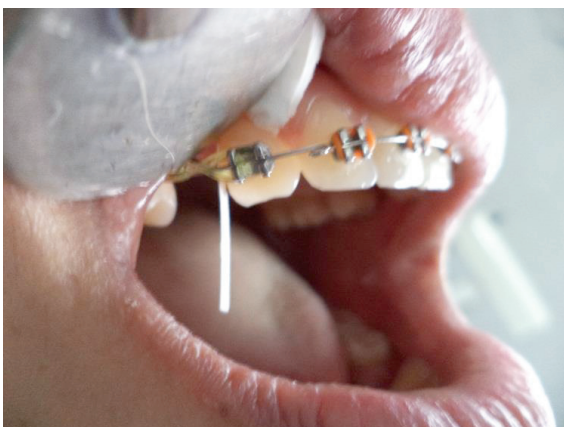
Figure 1. GCF collection with filter paper strip. GCF was collected at distal site of canine represented resorption area.

GCF samples were collected using filter paper strips (Whatman, No. 1) (Figure 1 and 2). Samples were collected at distal side of upper right and left canine at just prior to mechanical load (0 hour), 24 hours after mechanical load, and 72 hours after mechanical load. Teeth were gently washed with water, the site under study were isolated with cotton rolls, and dried gently with air-syringe before paper strips were applied. Paper strips were inserted 1 mm