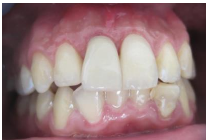
Figure 3. Twelve months follow-up post-surgery.

OSSIFI (Equinox Medical Technology B.V., Holland) bone graft materials used were biphasic calcium phosphate (BCP) (containing 40% \beta -tri calcium phosphate ( \beta -TCP)-60% hydroxyapatite (HA)) on the outer layer and DFDBA (BATAN, Jakarta, West Java, Indonesia) on the inner layer of the defect. OsseoGuard (Collagen Matrix, Inc., Franklin Lakes, NJ, USA) resorbable collagen membrane was used to cover the graft. Tension-free flap was made in order to promote the healing process. Five hundred grams of paracetamol (INDOFARMA, Indonesia) was prescribed 3 times a day for 3 days as an analgesic.