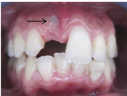
Figure 1. The implant on #11 was detected on labial aspect (seen by arrow).

From clinical examination, the operator found that patient had an average smile line and thick periodontal biotype. Periodontal parameter was evaluated and the oral hygiene index-score (OHI-s) was 1.7 (based on Silness and Loe). 9 Pocket depth on labial was 5 mm. Bleeding on probing score was negative. Implant thread was exposed on the labial aspect. No mobility and suppuration were found.