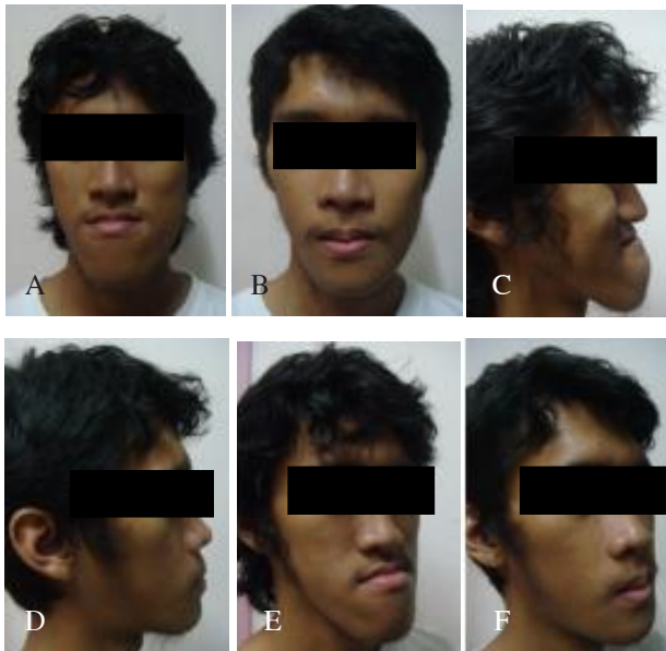
Figure 4. A, C, E) Presurgical ekstraoral photographs. B, D, F) post surgical ekstraoral photographs-1.