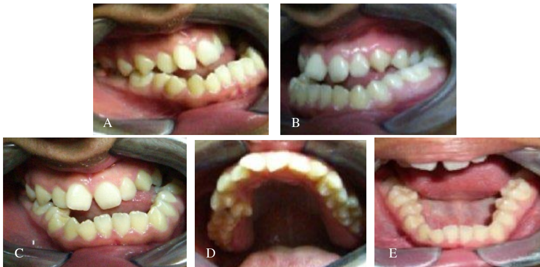
Figure 2. Pretreatment intraoral photographs. A) right side; B) left side; C) front; D) maxilla; E) mandibula.