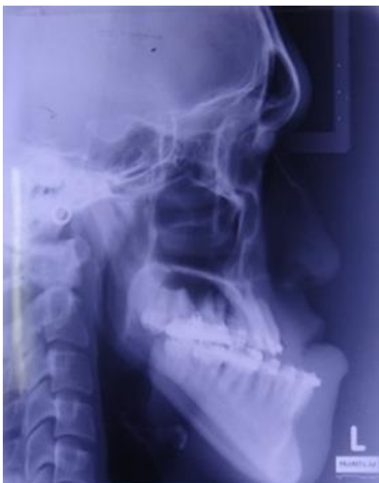
Figure 3. Presurgical cephalometric radiograph.

The analysis of intraoral confirmed an angle class III malocclusion with antero posterior discrepancy in the molar relationship was more than 10 cm, and a -13 cm incisor overjet, absence of overbite were measured. The mandibular dental midline were deviated 6mm to the left. There was posterior crossbite on the left side, mild crowding in the lower as well and compensation of incisor inclination in both arches (Figure 2).