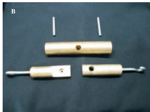
Figure 2. Shear strength test aid appliance (A and B).