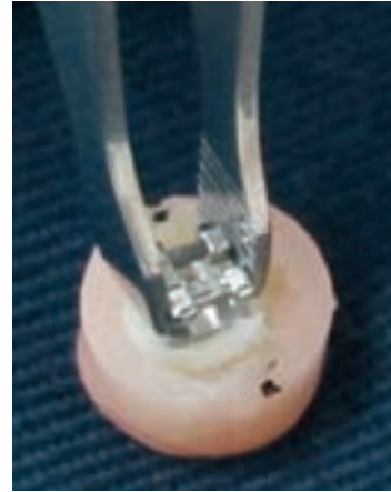
Figure 1. Bracket attachment.

Because of this problem, an alternative remineralization agent is needed, one that does not lower the bonding strength of the orthodontic brackets. It is stated that casein phosphopeptides – amorphous calcium phosphate (CPP-ACP) paste can help remineralization. 7 CPP-ACP acts as a remineralization and anti-cariotic agent due to its plaque-preventing property and also plays the role of calcium and phosphate reservoir on dental surface. 8 Casein phosphopeptides-amorphous calcium phosphate fluoride (CPP-ACPF), the combination of CPP-ACP with