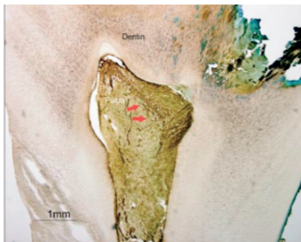
Figure 2. A specimen with pulp lesion. Numerous PGP 9.5-positive nerve fibers were concentrated heavily in areas subjacent to the lesions (arrows).

The present study has demonstrated the distribution of nerve fibers within the pulp with caries progression. Neural