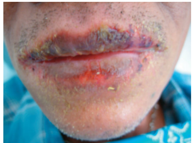
Figure 1. Visit 1: There was hyper pigmentation, yellow and red crusted on upper and lower lips.

On 27 May 2008, extra oral examination showed the upper and lower lips of the patient had hyper pigmentation, painful, yellow and red crusted. Intra oral examination could not be done, because of the pain (Figure 1).