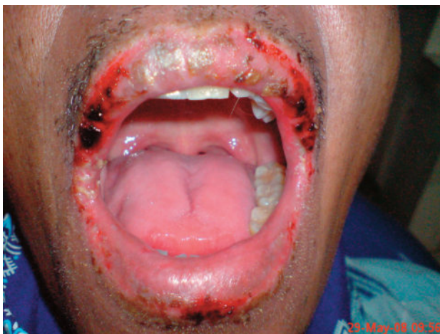
Figure 3. Visit 2: There were crusted, peeled and bleeding on upper and lower lips.