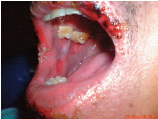
Figure 2. Visit 2: There were ulcers, multiply, irregular form, red barrier and white pseudo membrane.