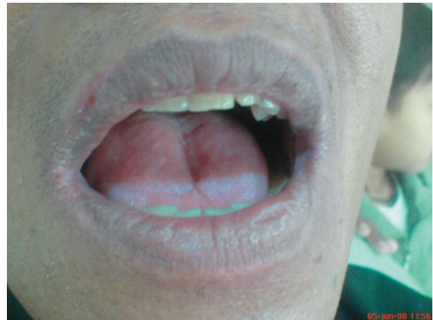
Figure 4. Visit 3: There were red crusted and peeled on upper lip and corner lips.