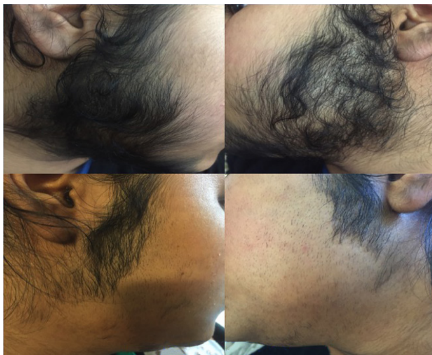
Figure 3. Hair reduction in a patient after 2 sessions of Nd:YAG laser hair removal.

In summary, the ruby laser (694 nm), alexandrite laser (755 nm), diode laser (800 nm), intense pulsed light source (550-1,200nm), and the Nd:YAG laser (1,064 nm), with or without the application of carbon suspension, work on the