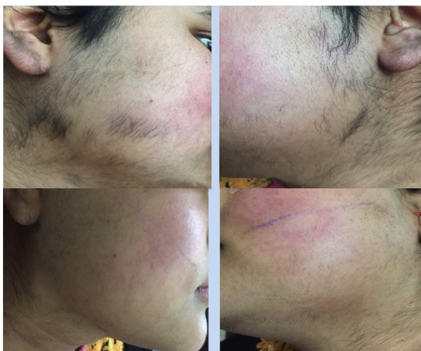
Figure 4. Significant hair reduction in the same patient after 4 and 6 sessions of Nd:YAG laser hair removal.

principle of selective photothermolysis with the melanin in the hair follicles as the chromophore. Multiple treatments are necessary to achieve satisfactory results regardless of the type of laser used. After repeated treatments, hair