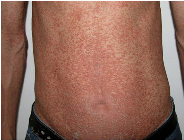
Figure 1. Erythematous scaly papules coalescent into large plaques on the trunk.

matosis that had rapidly spread during the previous week. It had started three days after initiation of Insulatard® ([Neutral Protamine Hagedorn insulin]: 12 IU in the morning; 8 IU in the evening) and Actrapid® ([soluble regular insulin]: 4 IU b.i.d.) for a recently diagnosed diabetes mellitus type 1. The patient's past medical history showed neither personal nor familial previous episodes of papulosquamous disorders. No other medical condition or concomitant medication intake were noticed. The patient had not received any vaccination during the previous five years and he denied any trauma.