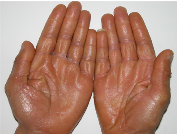
Figure 2. Bilateral orange-red waxy keratoderma.

Cutaneous examination revealed large areas of erythematous orange scaly plaques with small islands of uninvolved skin, as well as follicular keratotic papules. These lesions were located on the trunk (Figure 1) and limbs. The patient also had an orange-red waxy keratoderma on his palms and soles with some fissures (Figure. 2). No nail changes and no mucous membrane involvement were observed. There was no other organ or systemic involvement.