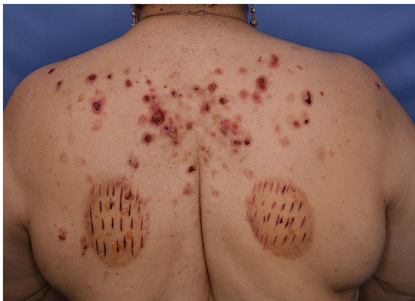
Figure 1. Tense bullae on the trunk, with a preference for the Hijama therapy site.

BP is described as an autoimmune blistering disease, which involves cellular