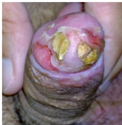
Figure 1. Clinical photograph showing scaling and erosion on the glans.

A 46-year-old man presented with complaints of scaling and erosion over the glans for the preceding 5 years. He had undergone circumcision 12 years earlier, when he noticed depigmentation over the glans; a few years later, thick, scaly crust developed over the glans. He had no history of high-risk sexual behavior. The patient had previously been treated with topical steroids, emollients, and calcineurin inhibitors without much improvement. On examination, there was hypopigmentation and sclerosis of the glans with localized, thick, yellowish, nail-like keratotic scaling along with underlying induration and superficial erythematous erosions (Figure 1). There was no associated lymphadenopathy, and systemic examination was within normal limits. A skin biopsy from scaly indurated plaque showed hyperkeratosis, parakeratosis,