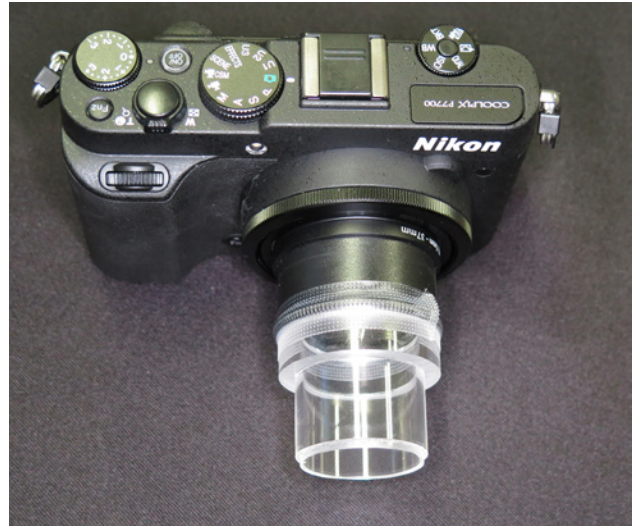
Figure 3. The typical structure of the dermoscope composed of a digital camera (COOLPIX P7700; Nikon, Japan), a macro conversion lens (MNS-202; Raynox, Japan), and a self-made transparent spacer. The macro conversion lens is mounted on the camera through a 40.5-37 mm step down ring (C-B-405a; Hassendo, Japan). The transparent spacer is taped to the tip of the conversion lens.

This dermoscope has potential advantages. In practical use, surgical light illumination improves the visual recognition of the skin lesion, especially at high-power fields. In research use, this dermoscope provides high flexibility in the selection of the light source, camera, macro conversion lens, and the design of the transparent spacer. The easy exchange-