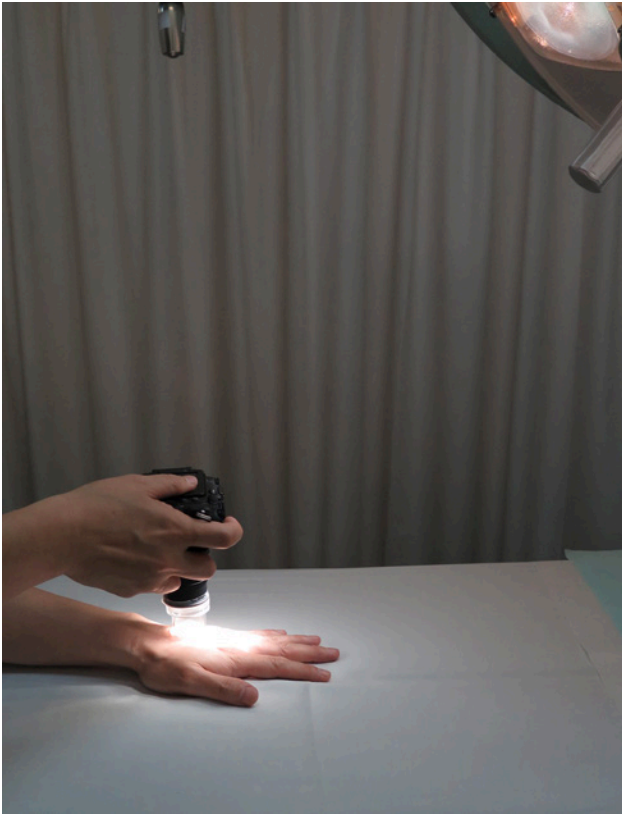
Figure 2. Dermoscopic examination is performed with a gel applied to the skin surface under surgical light illumination from an oblique direction.

ring (C-B-405a; Hassendo, Japan). The transparent spacer is taped to the tip of the conversion lens. The transparent spacer consists of three acrylic parts: a larger tube, a smaller tube, a disk, bound together with adhesive. (Figure 4A). The larger transparent acrylic tube has a 40 mm outer diameter, 30 mm inner diameter, and 10 mm length (Figure 4B). The smaller transparent acrylic tube has a 32 mm outer diameter, 28 mm inner diameter, and 20 mm length (Figure 4C). The transparent acrylic disk has a 30 mm diameter, and 2 mm thickness (Figure 4D).