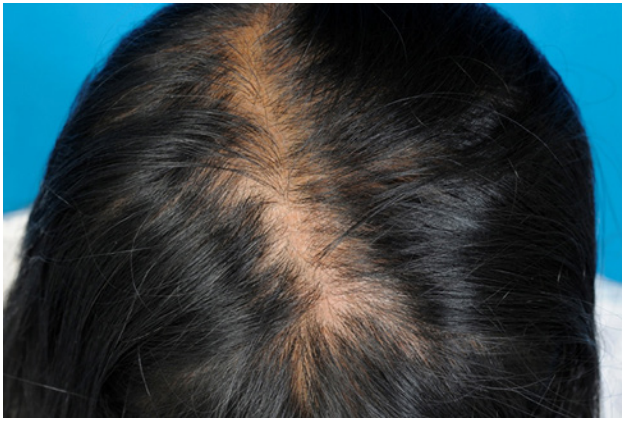
Figure 1. Bizarre-shaped patchy alopecia on vertex scalp. [Copyright: ©2015 Sombatmaithai et al.]

break easily [4]. In addition, it also leads to an inflammatory tinea capitis, which often leads to misdiagnoses.