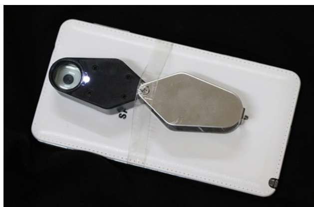
Figure 1. Jeweller’s loupe with inbuilt LED lighting attached to the camera of a Samsung Note 3® mobile phone.

too, the imaging is done from a distance without actual contact with the fluid. The loupe is held at a distance of about 5 cm from the skin after a sufficiently thick layer of alcohol gel is applied over the skin (Figure 2). The technique is not “true” dermoscopy as such, but helps to visualize basic dermoscopic features. Compared to the technique described by Blum and Giacometti [1], we feel that the magnification actually adds to the quality of the image (and here it is true magnification, not