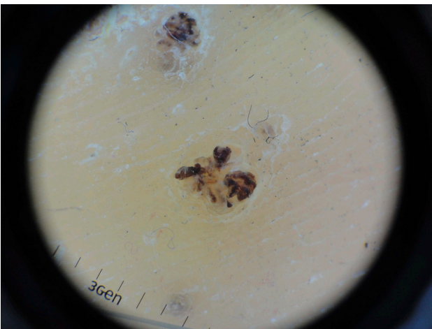
Figure 2. Thrombosed capillary loops are observed by dermoscopy. The transparent glass slide does not obscure observation of the lesion. As a mechanical barrier, it can prevent potential transmission of bacterial and viral infections.

made from standard household plastic wrap [8]. It can act as a mechanical barrier. However, the method has similar limitations as with PVC film described above.