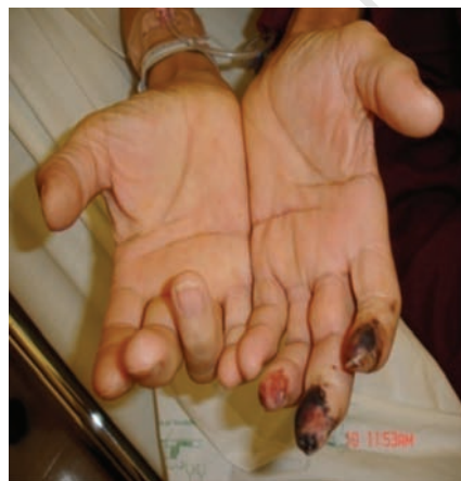
Figure 1. Necrohemorrhagic lesions in the distal phalanx of the 2 nd , 3 rd and 4 th fingers.