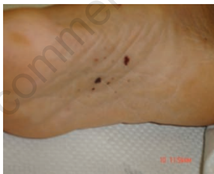
Figure 2. Petechial lesions in the plant of the right foot.