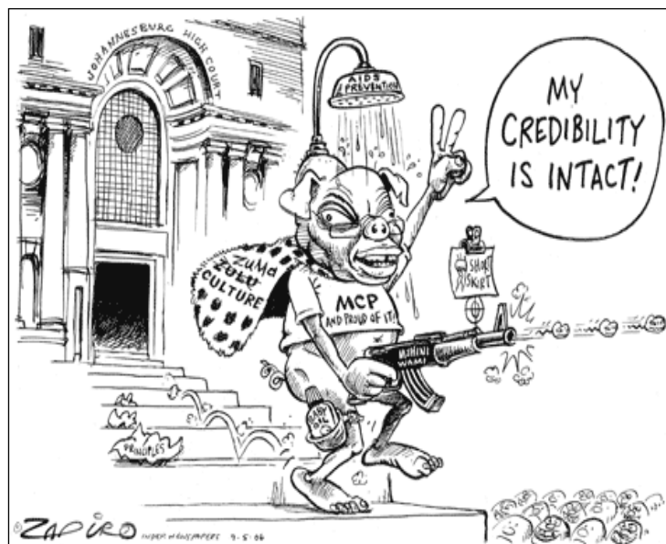
Fig. 1. Jacob Zuma cartoon.

of male chauvinism. This last point demonstrates the students attempt at locating the discourse of gender relations within distorted Zulu culture.