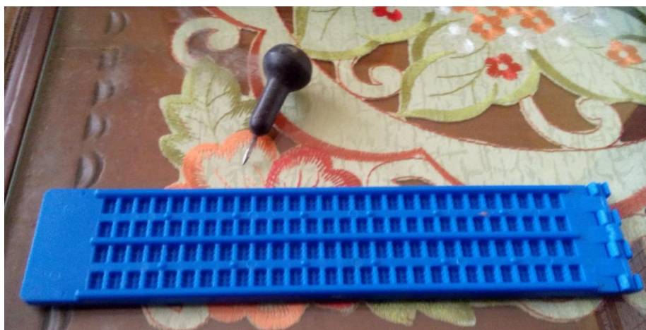
Figure 6. A reglet as the tool for writing Braille text used in the school.

impairment. Therefore, they believed that it was compulsory to teach the students how to read and write Braille text (see Bozic & McCall, 2007). Figure 6 illustrates a reglet, the tool for writing Braille text, used in the school for visual impaired students.