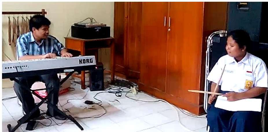
Figure 5. Musical learning for visual impaired students.

For Teachers EK, AC and MT, a Braille text book should not be ruled out as a resource in the school for visually impaired students. Although students can learn English without the aid of Braille text, it should be still considered as a necessary skill for teaching students with visual