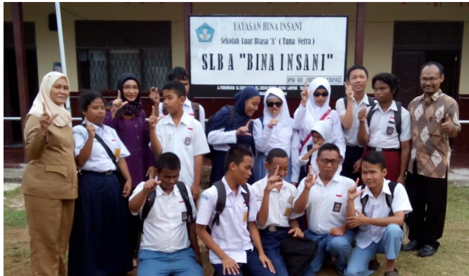
Figure 1. The students at the school for visually impaired students in Bandar Lampung, Indonesia.

males, 4 females) were observed in 4 vision to total blindness. classes. Students' vision varied from low