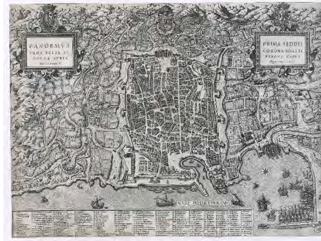
Figure 1. Map of Palermo and of Conca D'Oro by M.F. Cartari – Rome 1581. Right: the Maredolce's site, the bridge 'of the Admiral' (ponte dell' Ammiraglio) and 'Conca D'Oro' limits.

This image coincides, if only in part, with the descriptions given by Arab and medieval geographers. It also coincides with the activity of Norman, Suebi and Aragon kings who paid great attention to the use and maintenance of woods and forests. Even in the first cartographic representation (Pietro da Eboli, n.d., rep. 1994) the royal gardens — iconographically represented in a single quadrant — are illustrated with flowers, rare plants and predatory animals (lynx).