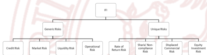
Figure 3: Risk Profile of IFI

Nevertheless, this does not imply that the Sharia' law proscribes the taking of risk in investment. In fact, investment is very much encouraged in Islam, provided the risk environment is properly studied beforehand. For example, the Sharia' allows risk-taking in entrepreneurship and those that naturally occur as a result of natural disasters and calamities, which are reflected in several Islamic Banking products such as Mudarabah (profit-sharing contract), Musharakah (partnership contract), and Takaful (Islamic insurance). By the same token, Islamic financial units such as IFIs are required to properly assess the variant risks in banking, which do not only include generic risks such as credit, market, liquidity and operational, but also those that are specifically unique to IFIs risk profile such as rate of return, Sharia' non-compliance, displaced commercial, and equity investment risk (see Figure 3 ).