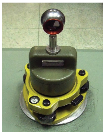
Figure 5: Target Set - Tribrach Topcon, Leica carrier GZR3, Leica prism RRR1.5