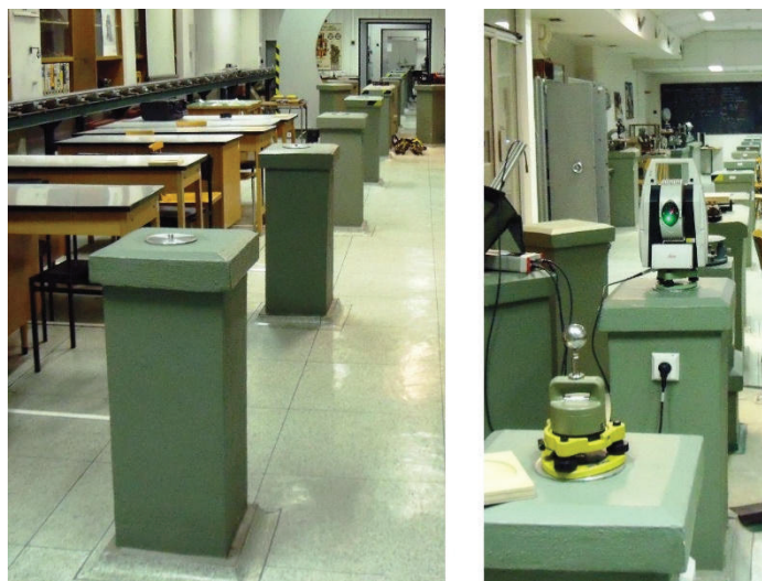
Figure 2: Photographs of the baseline