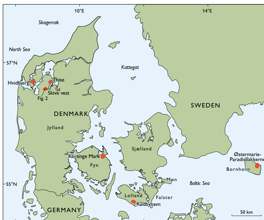
Fig. 1. Map of Denmark showing the locations of the six areas selected for detailed studies of their suitability as disposal sites for radioactive waste from Risø.

The areas that were chosen for further study were selected from 22 initial targets (Gravesen et al. 2011) based on compliance with specific criteria (see below) that had previously been established from geological models (Gravesen et al. 2012a). The six selected areas (Fig. 1) are located in different geological settings. The Østermarie-Paradisbakkerne area on Bornholm consists of Precambrian Paradisbakke migmatite and Bornholm gneiss. In the Rødbyhavn area on Lolland, Palaeocene clay rests on Maastrichtian chalk, while the Kertinge Mark area on Fyn comprises thick Palaeocene clay deposits overlying Danian Limestone. In the Hvidbjerg area of north-west Jylland, Palaeocene and Eocene clay for-