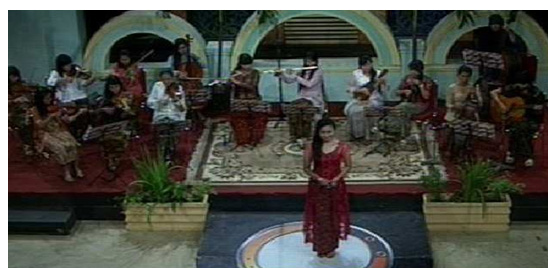
Figure 4. The performance of Sri Gandhul kroncong orchestra.

Data from symphonic orchestration was obtained through the Sri Gandhul kroncong orchestra Yogyakarta led by Septi whom musicians are all the female performers.