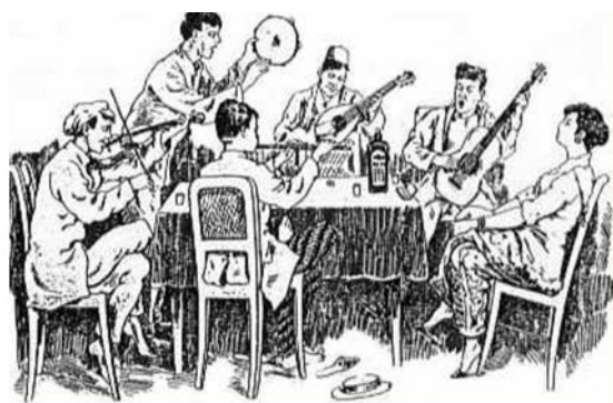
Figure 1. The first formation of kroncong players

Manusama (1919) said that the mardijkers group in Tugu village had a different identity from the mardijkers group in Batavia. Manusama believed that Tugu musicians were veterans of the Portuguese army from Goa, India who decided to stay in Tugu village. From the book Manusama Moresco sheet music that is transcribed into a song that must be performed in every Krontjong Concours festival in Batavia, is also marked by the following painting of a kroncong orchestra in Batavia and the instrumentation they used at that time.