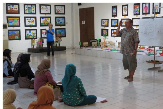
Figure 4. Workshop of Teaching Drawing