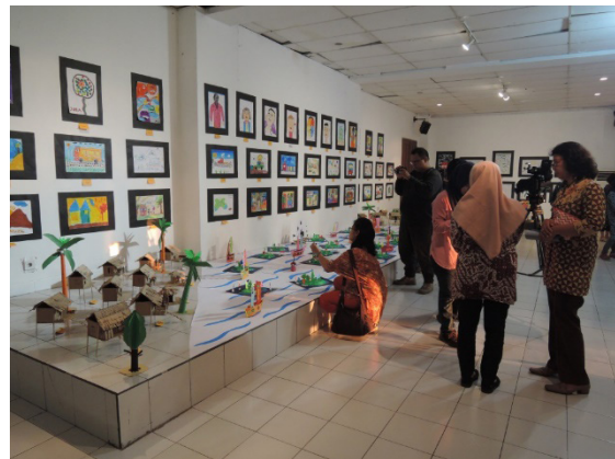
Figure 3. Annual Exhibition of Children's Works of Drawing