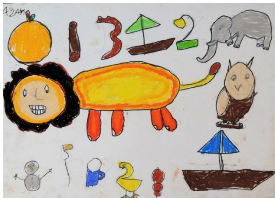
Figure 5. Drawing based on Numbers by Azam (5 years old)

jects based on numbers from zero to nine in the order of lines, resembling the way to write in a page. In the painting, for examples, the number "0" is developed into an orange, a lion, and a glass, number "2" into the shape of a goose, number "3" into a snake and an elephant, number "4" into a ship, number "6" into a snowman, and the number "9" into an owl. Azam first drew objects in a schematic way and then filled the shapes with colors, but colors here are used in connection with reality.