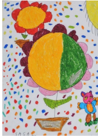
Figure 6. Sunflowers by Shasha (5 years old)

Drawing based on basic geometric shapes is shown in Figure 6. Shasha (5 years old) drew two flowers in a pot by developing circles, half circles, and a trapezoidal.