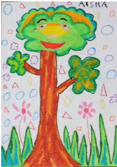
Figure 7. Smiling Tree by Aisha (7 years old)

In her drawing, Aisha combines forms of a tree and a human. The leaves are drawn resembling the hair and the pair of branches resembling the hands. The idea that Aisha wants to express is that a tree can smile happily like a human. Therefore, he depicted the lips in the act of smiling, the uplifted hands, and the opened fingers, giving the impression of excitement. As the main object, the tree and the grass are drawn schematically, and the background is just filled with outlines of abstract shapes with varying colors.