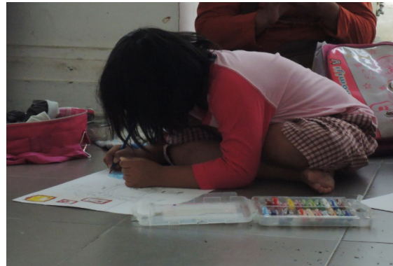
Figure 2. Child Doing Her Drawing

vity. Adults model drawing behaviors on the basis of shared interests and activities.