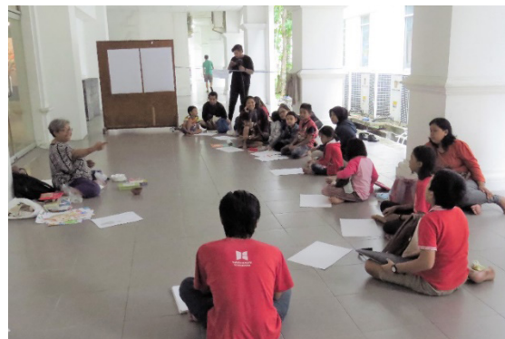
Figure 1. Teacher Giving Introduction to Children and Parents

could interact with children and their parents directly. First of all, she gave an explanation about the lesson including the theme or subject matter, form or composition, and technique that will be used in the drawing program. To assure the participants' understanding, she gave one or more examples while explaining some concepts or aspects as clearly as possible. She intentionally gave a more detailed explanation of certain concepts and warnings only to the parents in order that they would use them in guiding their children, such as the function of the background and some principles of composition in a drawing. While giving her examples, she also presented appreciation of some children's drawings or paintings done by other children or posted in catalogs to attract the participants' interests.