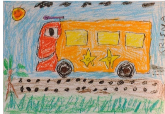
Figure 8. Smiling Bus by Krishna (5 years old)

items. The colors are used in accordance with reality in general, such as gray and black for roads and stones, green for grass and leaves, brown for tree trunks, blue for the sky, yellow for the sun, and black for birds.