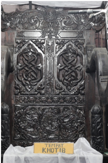
Figure 8. The pulpit (Mimbar) (4 December 2018)

pilasters, on top of which are decorated lotus flower bud motifs. Next to it is a carved lotus flower blooming in a square frame. At the end of a square-shaped pilaster carved ornate lotus flower bud motif. In the center of the pilaster, the body is carved meander decoration and at the very bottom, there is a pedestal, a round shape for a round and pyramid-shaped pilaster for a square pilaster. Pilaster decorated with twisted; the height of the mast 1.51 m, width 13 cm for the square and 14cm for the round, 8 cm thick from the front wall of the mihrab (Alamsyah, 2010). Here is the pulpit where the sermon is.