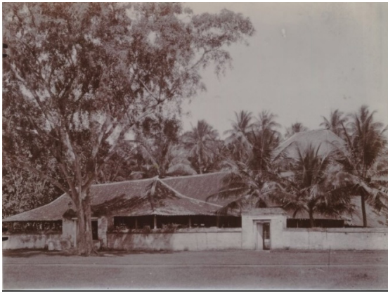
Figure 2. Masjid Agung Sang Cipta Rasa In 1911 (colonialarchitecture.eu.accessed on 6 August 2018)

feeling, a true heart, and is a reflection and self-approach with the Creator, Allah Subhanahu Wata'ala (Sudjana, 2003).