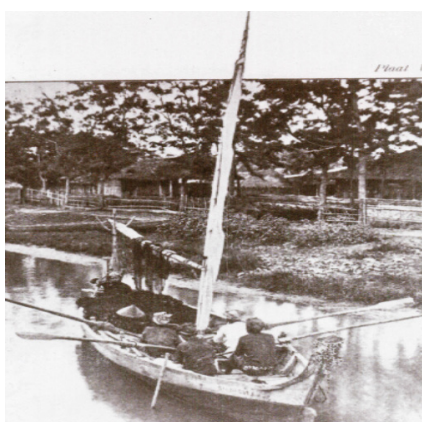
Figure 1. The sailboat (Bingkung) from Cirebon, West Java (5537/23, collection of KIT Jawa Barat, National Archives of the Republic of Indonesia).

a coastal area, became an important base in inter-island shipping and trading lines. Based on the arguments presented in the previous paragraph, that the coastline is the entrance to outside culture, the location of Cirebon as the border between West Java and Central Java makes Cirebon an important role for inter-island shipping and trading. According to Tome Pires (Pires, 2016), Cirebon has a good port, where there are 3 or 4 Jungs in that place. This place has large amounts of rice and other food ingredients. Here is a picture of a jung boat in Cirebon.