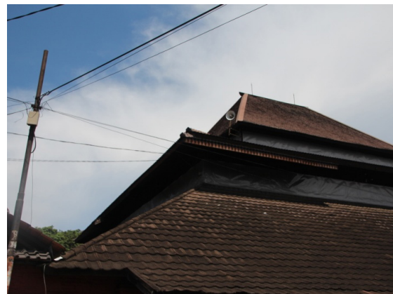
Figure 4. The porch of Masjid Agung Sang Cipta Rasa Cirebon (12 October 2018)

ped like Meru with a crest decoration or momolo . Some ancient mosques that have a meru -shaped roof include Demak Great Mosque (three stories), Kadilangu Mosque (two stories), Banten Great Mosque (five stories), and so on (Balai Poestaka, 1926). From the oral tradition that developed in the community that Masjid Agung Sang Cipta Rasa Cirebon did not use momolo , because, during the reign of King Panembahan Ratu, an epidemic struck Cirebon. To eradicate the outbreak, Panembahan Ratu released her wand, which floated until it grabbed momolo , until the momolo broke up. Since then Sunan Kalijaga advised Panembahan Ratu that for Masjid Agung Cipta Rasa no longer be made by Momolo , but instead, the roof was transformed into a pyramid as a sign that there is no superior human being (Sudjana, 2003).