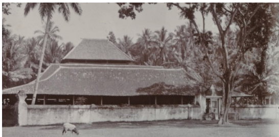
Figure 3. Masjid Agung Sang Cipta Rasa in 1911 (KITLV accessed on 6 August 2018)

The Great Mosque has several nicknames, among others: Sang Cipta Rasa, and Serambi Pakungwati. The first oldest porch is located to the left of the mosque (south) called prapayaksa, while the front porch (east) is called scenery. Here is a picture of the porch of Masjid Agung Sang Cipta Rasa Cirebon.