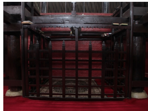
Figure 9. Maksurah (Tempat Sholat Sultan) (4 Desember 2018)

the inner porch. The foyer which is located around the main hall is an open building and the roof is united with the main hall. The porch consists of the porch of the south, east, north, and west. The porch located south of the main room is called the Prabayaksa porch, in the form of a rectangle, measuring 29 x 6.40 m, with tile floors and solid foundations. The eastern porch is called the porch of the view. In front of the entrance (east) there is a square hole measuring 5.60 x 2.60 x 0.40 m which is estimated to function as a foot washer. The north porch is measuring 29 x 6.40 m. On this porch there is a piece of rattan that functions as a clothes sun-drying of Sunan Kalijaga, the situation has been cracked and fragile. The west porch is measuring 33 x 7 m. On this porch, there is a drum with a length of 1 m and a diameter of 0, 80 m. The drum is named after Sang Guru Mangir or Kyai Buyut Tesbur Putih which is hung on a cross beam between two pushers.