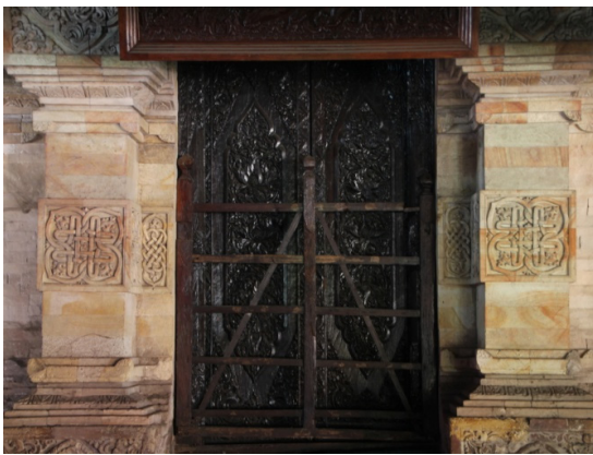
Figure 6. The Mosque Door (12 Oktober 2018)

The main door to the main room called narpati is located on the east wall, measuring 240 cm high and 124 cm wide. On this door, there are two doors, and on either side of the door, there are pilasters decorated with lotus motifs and tendrils on the top and bottom. Each measuring 1.95 m long and 53.5 cm wide, has a carved decoration of lilies, tendrils, and mirror frames. Carvings that are stacked on top of a door leaf are 1.24 m long, 40 cm wide, and in the middle of the carving arrangements are lined up with a tumpal decoration. The door near the east-west wall of Masjid Agung Sang Cipta Rasa has a height of 168 cm and a width of 68 cm, while the middle part has a height of 122 cm and a width of 55 cm.