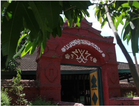
Figure 5. The gate or Gapura (4 December 2018)

The shape of the door or gate of Masjid Agung Sang Cipta Rasa is shaped like the Paduraksa Gate. At the main gate to the east of the middle section, there is a decoration in the form of three-tiered wings at the top, then the arch in the middle there is a decoration shaped barrel temple. Meanwhile, at the top of the archway there is an Arabic script, on the left and right there is the decoration of the barrel temple (Alamsyah, 2010). The barrel temple is a geometric decoration that is made rather prominent on the surface of the wall and consists of two types, one of which is as seen in the eastern gate to the south. The first type, rhombic shaped with the longest size of 1.60 m and the widest 82 cm. The distance between each other is 40 cm, usually known as a Portuguese salip form. The second type, in the form of a rectangle surrounded by hexagonal brick protrusions; the decoration includes a mirror frame motif; measuring 80 cm long and 50 cm wide, attached to a wall that is more prominent 10 cm from the perimeter wall is made of a brick structure that widens in the middle, smaller on the top and bottom. The middle part measures 50 X 50 cm, the top bottom measures 30 X 30 cm and the overall height is 70 cm. All of them numbered 20, and at the top they were mounted with lights.