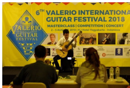
Figure 3. Seating position of finalist and jury

In addition to explaining the idea of intrinsic motivation, Lehmann et al. (2007, p. 49) also explain extrinsic motivation factors, which are important aspects of one’s musical development. The main extrinsic sources are parents, teachers, and peers.