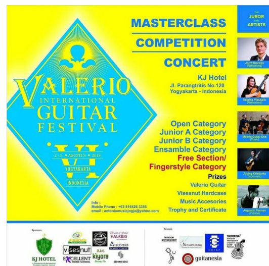
Figure 1. Poster Valerio International Guitar Festival 2018

One of the competition categories in the 2018 Valerio International Guitar Festival, which is the focus of this research, was the open category or open-to-the-public category. In terms of the age level, this category was the highest category because there was no age limit in it. Anyone might register and participate by following the rules made by the committee, namely: playing a single guitar within a time limit of no longer than 10 minutes in the preliminary round, which was held on August 2, 2018, wherein the 10-minute duration participants might play more than one piece of Music or repertoire. After the preliminary round, there were eight finalists who were fully determined by the jury to advance to the final round. In the final round, the selected finalists were asked to play a single guitar for a duration of shorter than 17 minutes, in which the finalists might play more than one piece of repertoire.