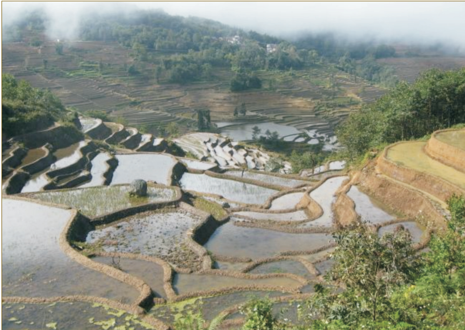
Photo 1. The rice terraces of Yuanyang, Yunnan Province, P.R. China