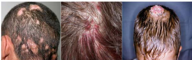
These pictures illustrated the early and late stages of infection by M. canis

Solanum nigrum is herbesiaus plant come from solonales order, solonaceae family, under the plantae kingdom. This plant was world-widely used as a traditional treatment for several disorders and chronic skin infections, such as ring worm, tinea, diarrhea, eye diseases, etc. The most active compounds of Solanum niger are alkloids and saponins. Furthermore, Solanum niger is composed of glycosides, carbohydrates and proteins which have the anti-clumping and antitumor activity [15, 16,17, 18] . The aim of this study is to determine the effective concentrations of AESn against M. canis , the pathogenic fungi of ring worm infection.