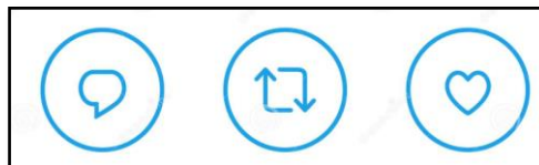
Figure 2. The Symbols of Reply, Retweet, and Like on Twitter

In addition to reply, Twitter also provides “a retweet” facility that helps users to re-send a tweet and to share tweet quickly to other users. Meanwhile, “like” helps users to show appreciation for a tweet. These facilities make a tweet alive in Twitter as the Tweeps could communicate each other. The symbols of reply, retweet, and like are presented in Figure 2 below.