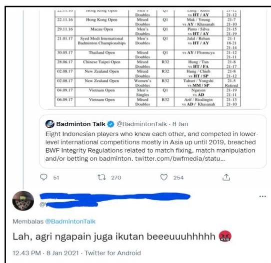
Figure 6. A Reply from a Badminton Fan in Twitter

as shown in the figure below. The use of the word “Lah” in Indonesian and an angry emoji shows that the fan feels regret to the mentioned badminton athletes.