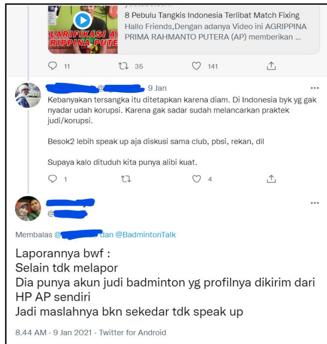
Figure 8. The Critical Response from A Badminton Fan