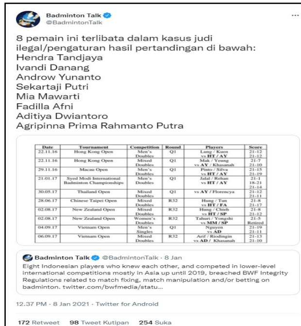
Figure 5. @BadmintonTalk Retweet about Sport Integrity Misconduct of Indonesian Badminton Athletes

Badminton Talk then followed up with a second tweet two minutes later. The second @BadmintonTalk tweet received more attention with 172, 98, and 254 retweets, quote retweets, and likes, respectively. The fanbase tweet went into greater detail about which athletes the BWF has sanctioned for breaking the sportsman’s code of conduct. Figure 5 presents a screenshot of the tweet from @BadmintonTalk.