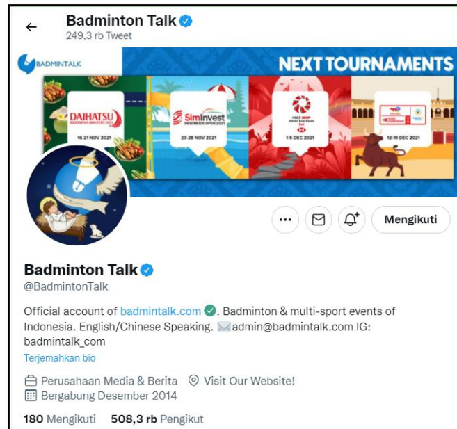
Figure 1. Badminton Talk Twitter Account’s Profile

Based on internal Twitter, Inc. data from January 1st to November 15th, 2021, this fanbase is clearly one of the most talked-about sports accounts in Indonesia in 2021.