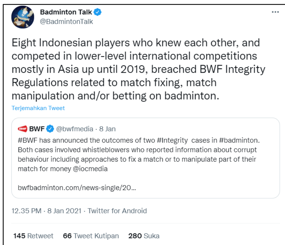
Figure 3. @BadmintonTalk Retweeted a BWF Tweet

On January 8th, 2021 the BWF official website broadcasted the publication, which was then tweeted on the same day by the BWF official Twitter account, @bwfmedia. Right after that, Badminton Talk's Twitter account @BadmintonTalk retweeted the BWF posted tweet. Figure 3 shows a screenshot of a retweet from the @BadmintonTalk.