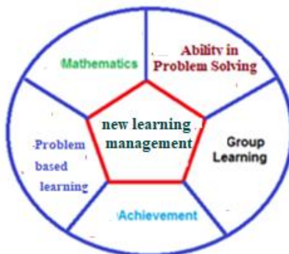
Figure 2. Components of a developed learning management model

The results of research concluded that the new learning management model as shown in Figure 2.