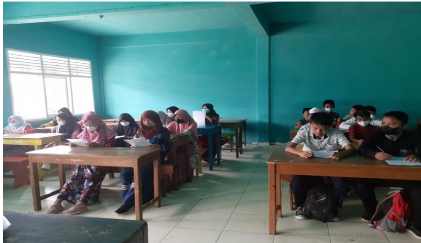
Figure 5. Students working on posttest questions

with a time allocation of 80 minutes. Student activities working on posttest questions can be seen in Figure 5 .