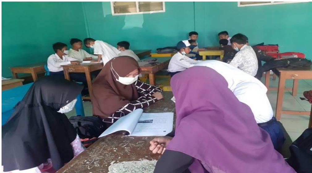
Figure 4. Activities of the fourth meeting

The fourth meeting was held on Monday, August 9, 2021. At this meeting, students continued learning using Student Worksheets, namely studying activity sheet 2, which contains set material given realistic problems. Students pay attention to a calendar included in Student Worksheets, then follow the steps consisting of the use of context, use of models, use of learner construction, interactivity, and linkage. They said that learning sets using Student Worksheets equipped with steps to solve each problem made it easier to understand the set material. Student activities at this meeting can be seen in Figure 4 .