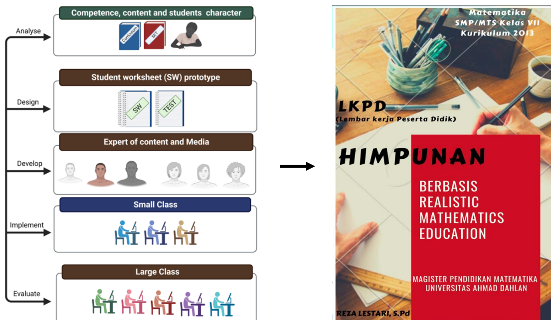
Figure 1. Research procedure

This research is development research using the ADDIE model, which aims to develop valid, practical, and effective student worksheets. Five stages are applied to developing the student worksheets using the ADDIE model, including analysis, design, development, implementation, and evaluation (Branch, 2009). The analysis phase includes material, mathematics curriculum, student characteristics, and work plan analyses. Next is the design stage; the student worksheets are designed according to the results analysis that has been done, the required instruments, and the determination of the validator. At the same time, the preparation of student worksheets and validation are included in the development stage. The first author carried out several teaching and learning activities at the implementation stage, including a pretest, student worksheets trial, posttest, and assessment. Finally, the evaluation stage focuses on assessing the results of the analyses of validity, practicality, and effectiveness and making improvements to the student worksheets. Figure 1 illustrates the research procedure.