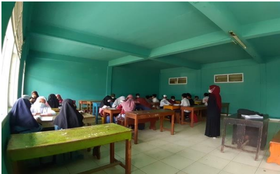
Figure 3. Activities of the second meeting

The second meeting was held on Monday, August 2, 2021. The student worksheets were introduced to the students, formed several groups, explained instructions for using the student worksheets, and then students studied the preliminary material. The activities of the second meeting can be seen in Figure 3 .